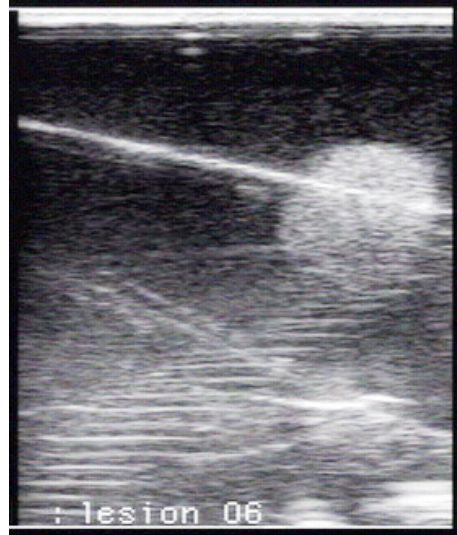
Fig. 4. Lab view (left) and ultrasound image (right) while the physician, wearing the Glasstron-based AR HMD, performs a controlled study with the 2000 AR system. She holds the opto-electronically tracked ultrasound probe and biopsy needle in her left and right hands, respectively. The HMD view was similar to Figure 3