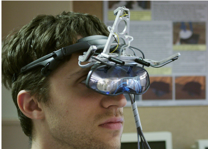
Fig. 2. Video-see-through augmented reality HMD built on the basis of a Sony Glasstron LDI-D100 device. The aluminum superstructure holds two miniature video cameras for image capture and three infrared LEDs for opto-electronic tracking of the HMD

Head-Mounted Display. We have modified a stereoscopic Sony Glasstron LDI-D100 HMD 1 for use as our display system. This HMD provides full color, stereo, SVGA (800x600) resolution displays in a lightweight design. We have added an aluminum superstructure to hold two Toshiba IK-SM43H video cameras for image capture and three infrared LEDs for opto-electronic tracking. Figure 2 shows the latest model of our HMD. This “video see-through” [1] device and its operation are described in detail in [10].