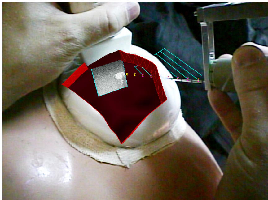
Fig. 3. HMD view during phantom biopsy experiment. Both the ultrasound probe (left hand) and the biopsy needle (right hand) are tracked. The needle aims at the bright lesion visible in the ultrasound slice. The system displays the projection of the needle onto the plane of the ultrasound slice (blue lines) and also displays the projected trajectory of the needle if it were fired at this moment (yellow markers)

Graphics and Computation Platform. The system runs on an SGI Onyx2 Reality Monster™ graphics computer equipped with multiple DIVO digital video input/output boards, allowing simultaneous capture of multiple video streams. The software routinely runs at frame rates of 20-30 Hz in stereo on this platform. Fig. 3 shows imagery displayed by our system during an experiment with a breast training phantom in late 2000.